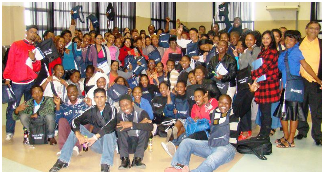
Above: C2A learning ambassadors in Phoenix

The Chance 2 Advance (C2A) programme, a community empowerment project in the Office of Unisa's Pro-Vice-Chancellor, is due to implement its Phoenix Durban mega learning initiative from 28 July to 9 August 2014.